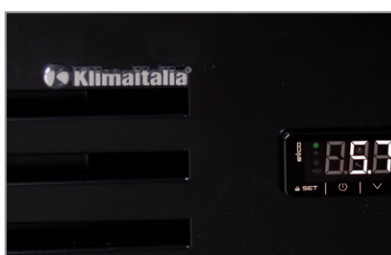
Termostato elettronico Electronic thermostat