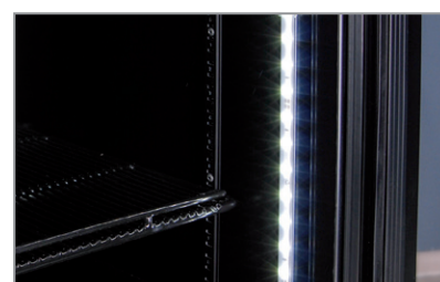
Luci led Led lighting